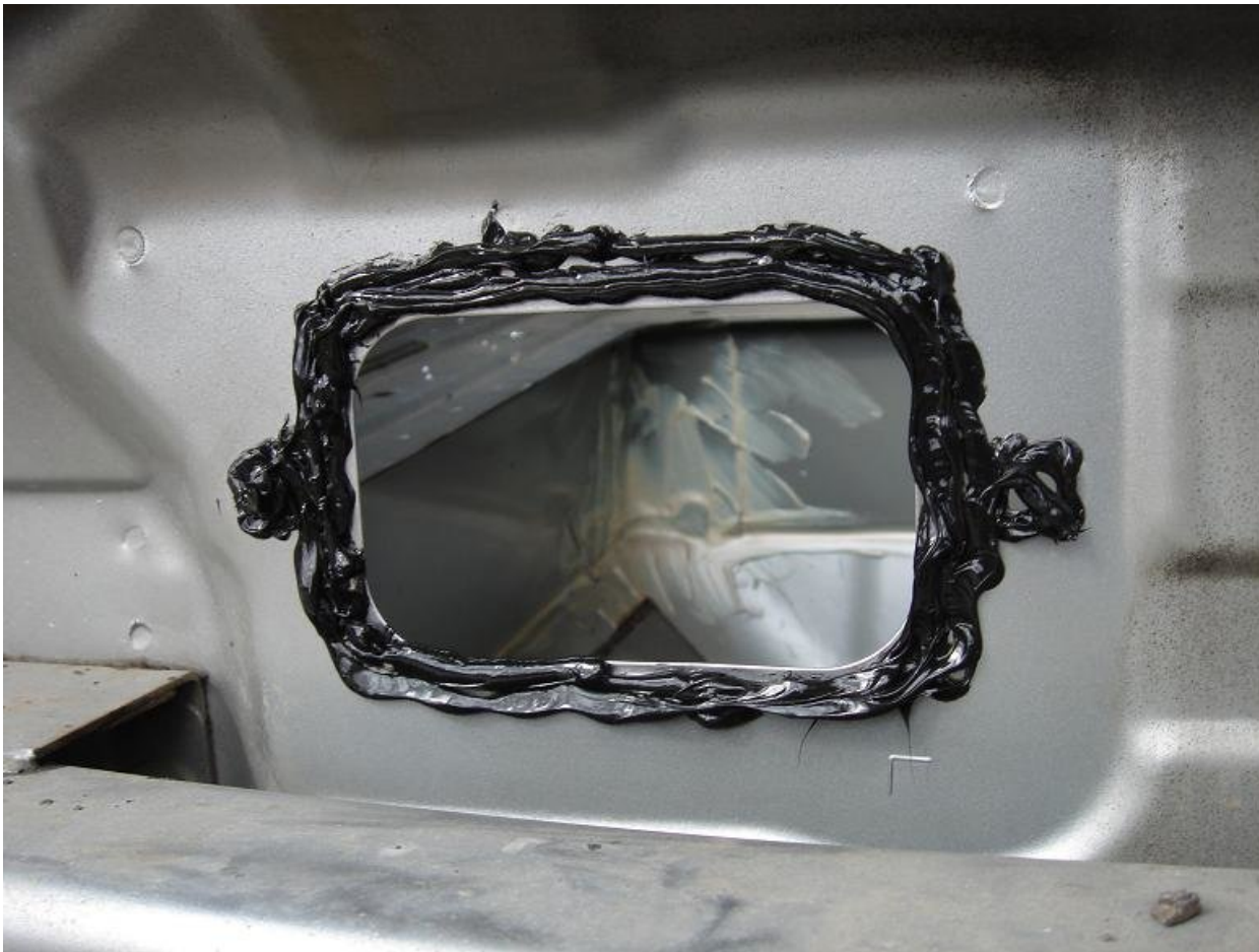
I removed the clips that originally held the vent in as it didn't give the vent a tight fit. I also peeled off the original gasket. Re-installed the Vent