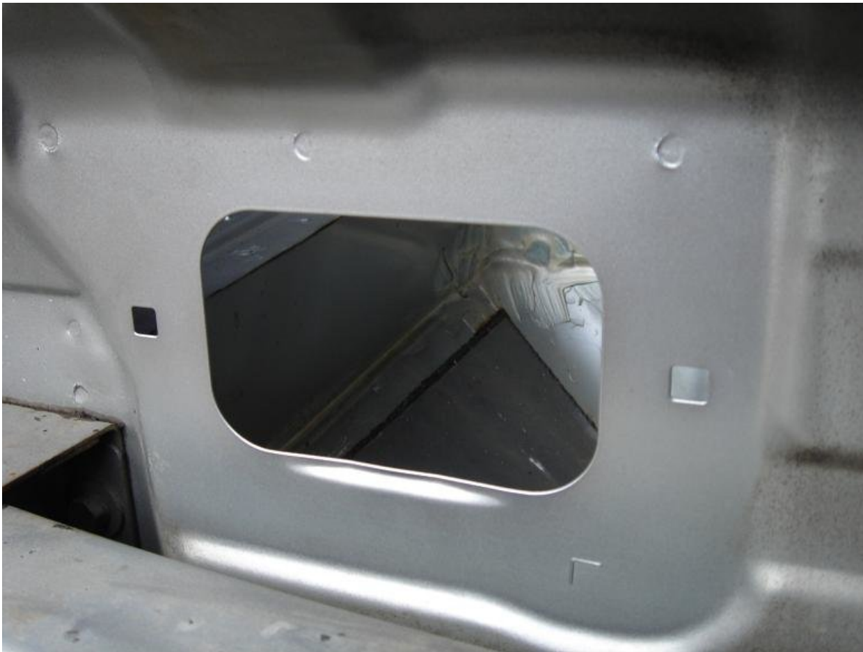
I used Silastic on the install but you can use any silicon. Apply to the metal cutout