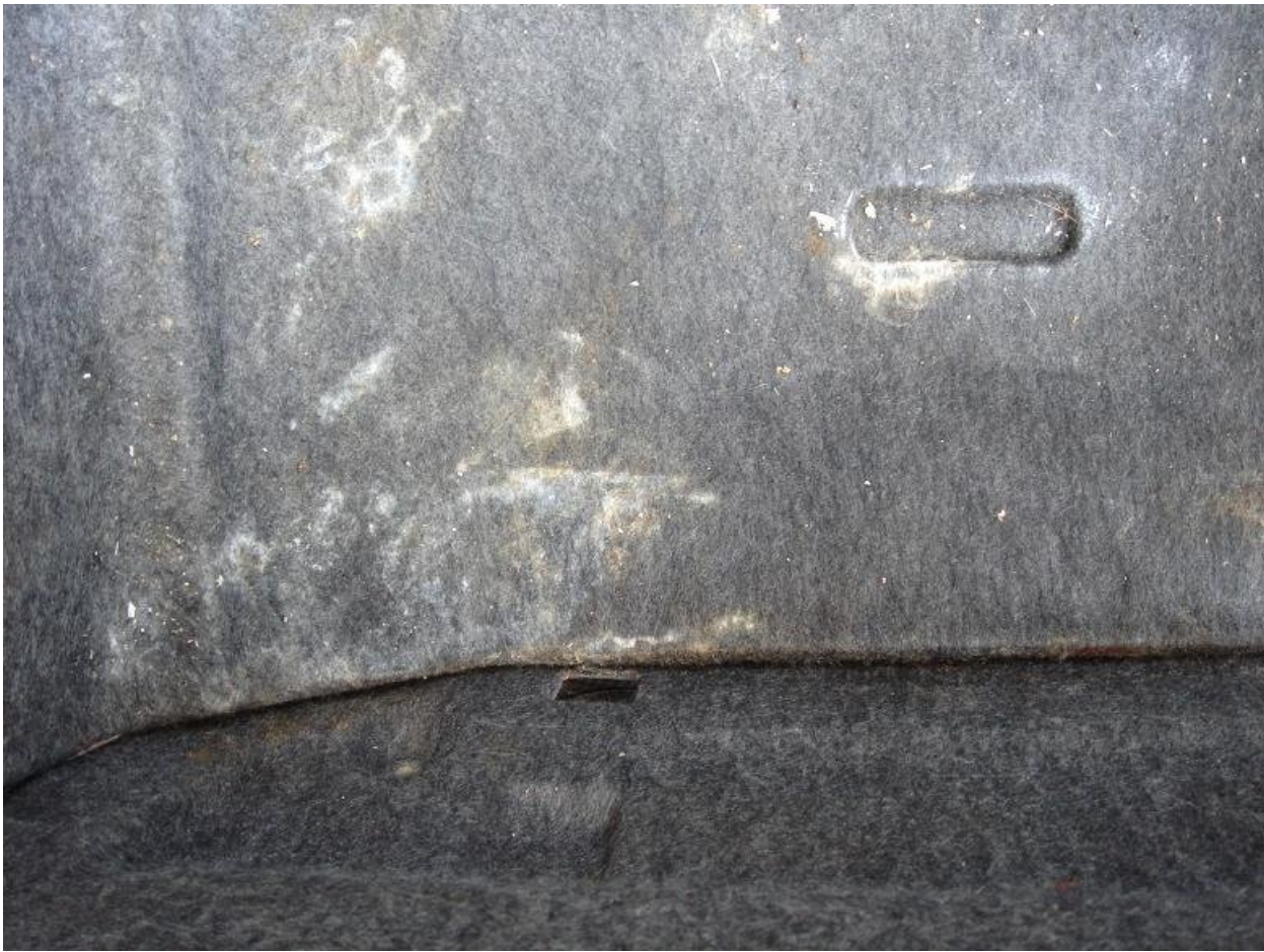
Then removing the lining of the trunk, got worse.. 😞